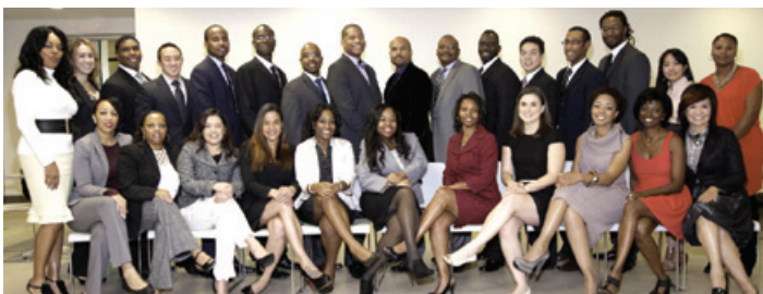
REAP Los Angeles Class