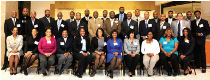
REAP Atlanta Class