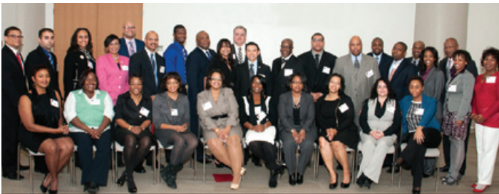
REAP Cleveland Class